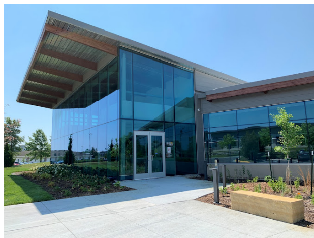
Johnson County Medical Examiner's Building

Johnson County, with a population of almost 630,000, is located in northeast Kansas and close to metropolitan Kansas City, Missouri – home to the 2020 Super Bowl champions, the Chiefs and the 2015 World Series winners, the Royals. In 2018, USA Today named Johnson County one of the top twenty best counties in the nation. Johnson County consistently ranks #1 in the "County Health Rankings" and is home to award winning parks (including several dog parks) and libraries. Johnson County has six excellent school districts and several colleges. Museums, shopping malls and the Kansas City International Airport are all nearby.