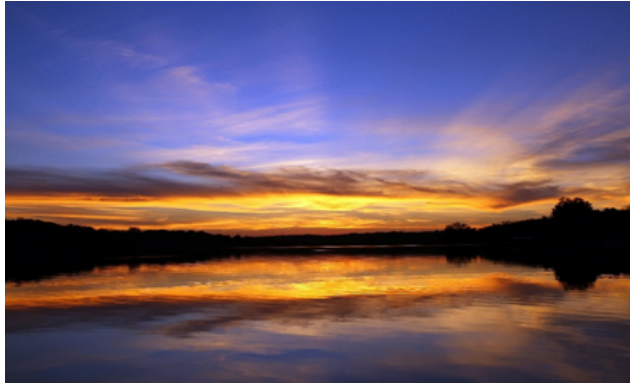
Shawnee Mission Park, Shawnee, KS