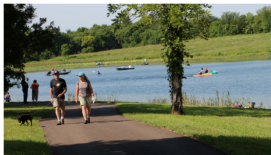
Lexington Lake Park, DeSoto, KS

Job Listings at Johnson County Government