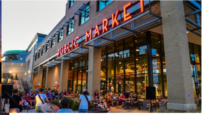
Public Market, Lenexa, KS