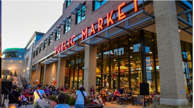
Public Market, Lenexa, KS