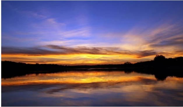
Shawnee Mission Park, Shawnee, KS