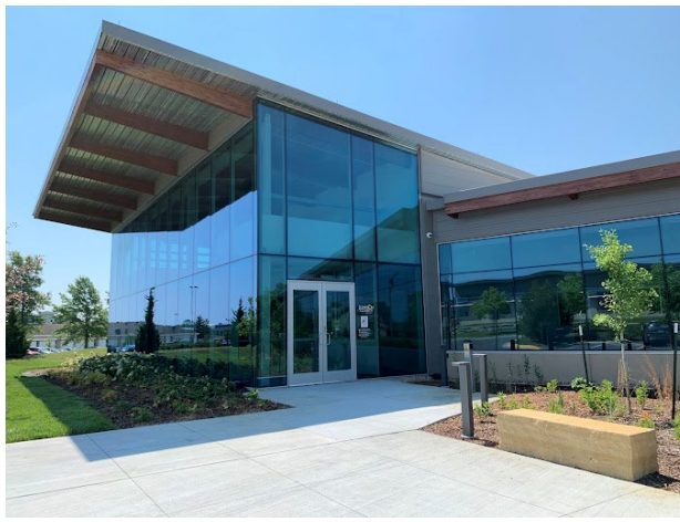
Johnson County Medical Examiner's Building

Johnson County, with a population of almost 600,000, is located in northeast Kansas and close to metropolitan Kansas City, Missouri – home to the 2020 Super Bowl champions, the Chiefs and the 2015 World Series winners, the Royals. In 2018, USA Today named Johnson County one of the top twenty best counties in the nation. Johnson County consistently ranks #1 in the "County Health Rankings" and is home to award winning parks (including several dog parks) and libraries. Johnson County has six excellent school districts and several colleges. Museums, shopping malls and the Kansas City International Airport are all nearby.