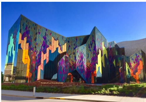
Prairie Fire Museum, Overland Park, KS