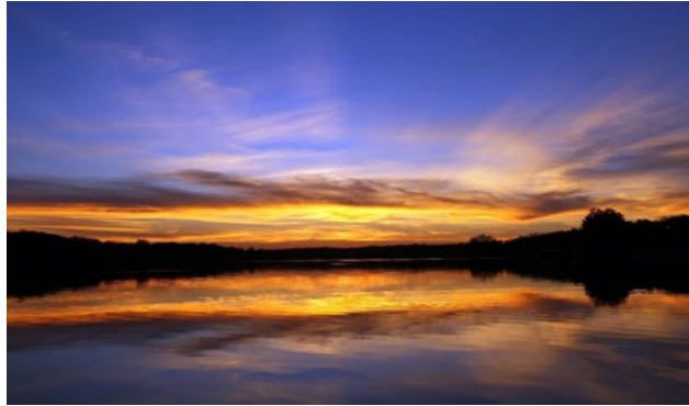
Shawnee Mission Park, Shawnee, KS