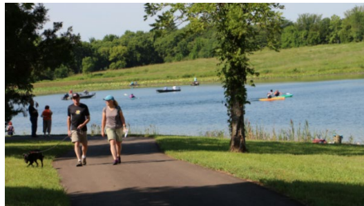
Lexington Lake Park, DeSoto, KS

https://www.jocogov.org/dept/human-resources/careers/jobs-open-public