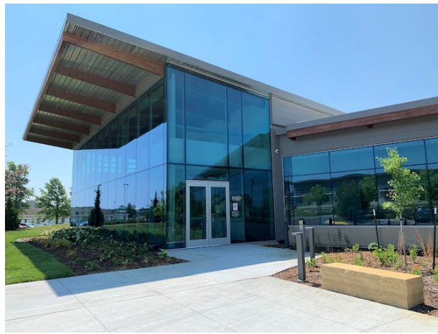
Johnson County Medical Examiner's Building

Johnson County, with a population of almost 600,000, is located in northeast Kansas and close to metropolitan Kansas City, Missouri – home to the 2020 Super Bowl champions, the Chiefs and the 2015 World Series winners, the Royals. In 2018, USA Today named Johnson County one of the top twenty best counties in the nation. Johnson County consistently ranks #1 in the "County Health Rankings" and is home to award winning parks (including several dog parks) and libraries. Johnson County has six excellent school districts and several colleges. Museums, shopping malls and the Kansas City International Airport are all nearby.