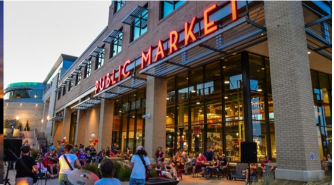
Public Market, Lenexa, KS